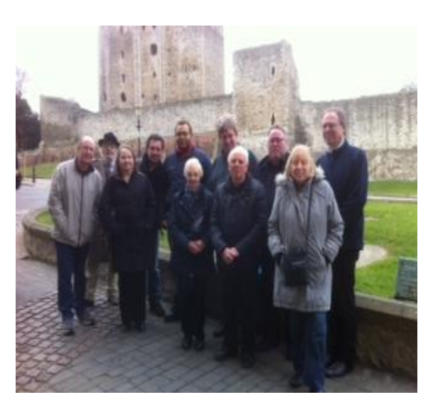
AIC BEXLEY - WORKING WITH THE HOMELESS

4 Members of the Group will represent you in the Assembly in Chatillon 2017